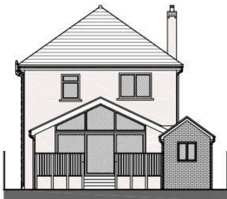
REAR ELEVATION WEST

Partially constructed extension: See plans in photos.